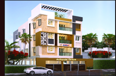
Achyuta Ortus Murali Street, Rajaji Nagar, Villivakkam, Chennai - 600 049.