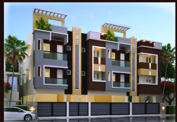
VIHAS GURU KRUPA Dee Gee Nagar, Soorapattu, Chennai-53