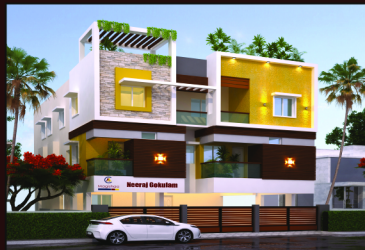
NEERAJ GOKULAM #25/34, 11th Street, North Jeganatha Street Villivakkam, Chennai - 600 049.