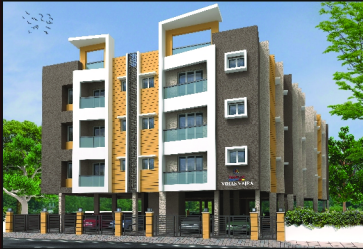
VIHAS VAJRA & MADHAV MAGNUS 3rd & 4th Street, Rajaji Nagar, Villivakkam, Chennai 600 049