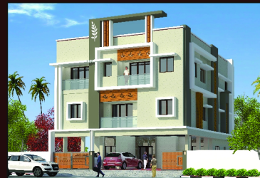
JAGADISHA ORTUS Sriraman Salai, Thanikachalam Nagar, Madhavaram, Chennai 600051.