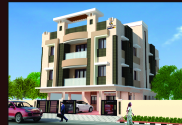
NANDAKESHAV OPTIMUS Rajiv Gandhi Nagar, Kolathur, Chennai-600 099.